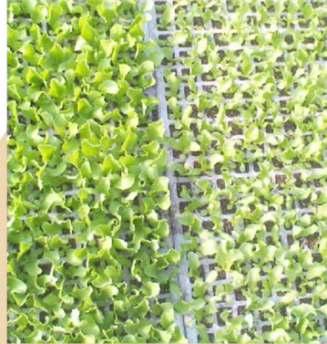
GreenLIFE ENDO™ Control